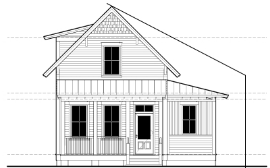
SECOND FLOOR PLAN SCALE: 1/8" = 1'-0"